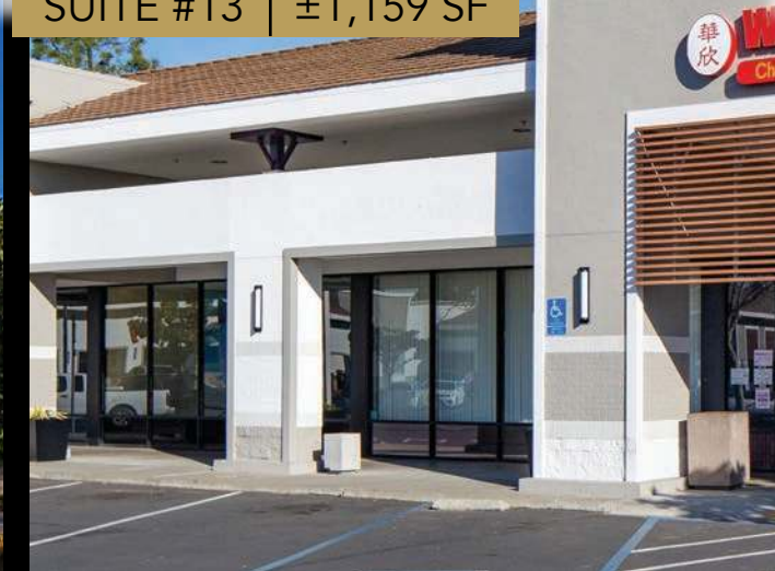
SUITE #13 | ±1,159 SF