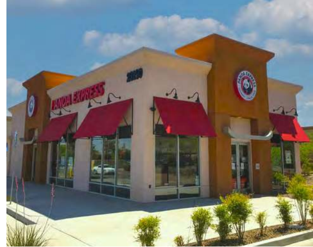
Lewis Retail Centers